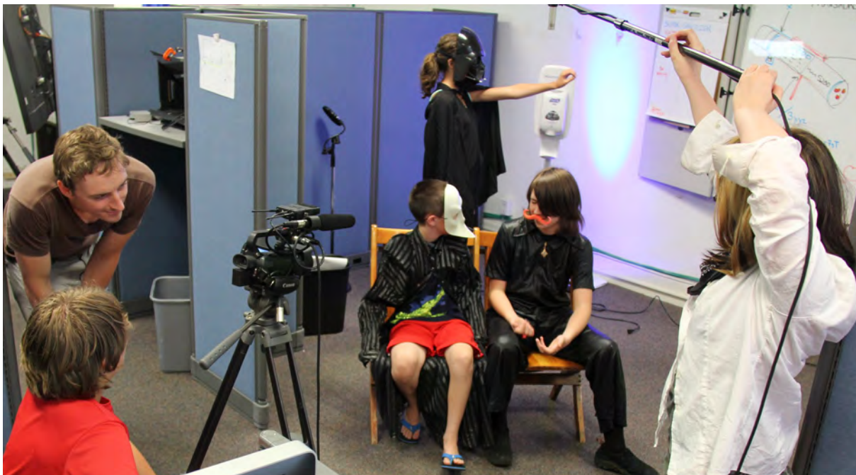
The crew captures a scene with Dr. McEvilface, Mustacharang and Darth Vader Junior. Somehow this makes sense in the movie!

This summer's week-long "Video & Tech Camp" featured 14 videomakers aged 9-13 creating their own commercials and PSAs, along with a short movie, while learning camera skills, video editing, audio, special effects, stop-motion animation and green screening – and this year added Minecraft as a video tool. They premiered "Digital Inferno: The Breakfast Club Assembles" before a packed house of parents and fans.