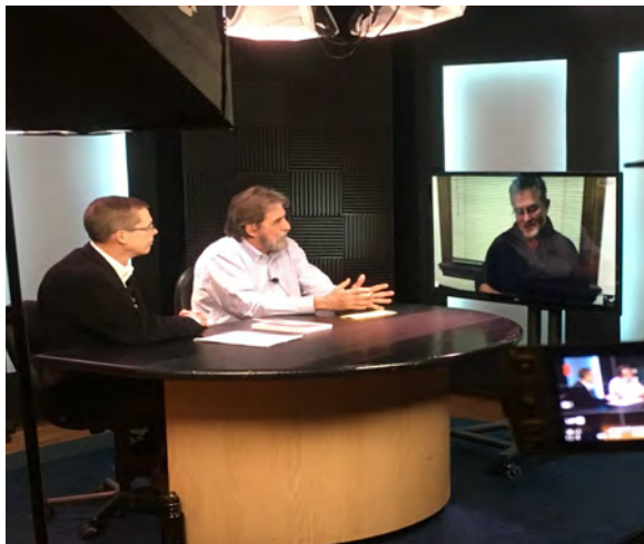
"Let's Talk About Mental Health" hosts a studio guest via Skype.