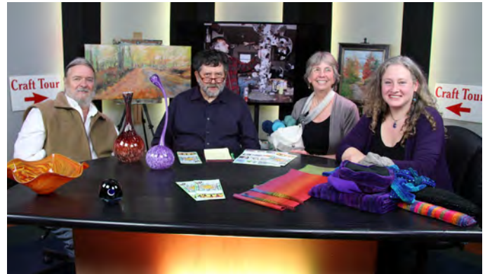
Putney Craft Tour artisans in BCTV's studio.

AIDS Project of Southern Vermont Arts Council of Windham County Brattleboro American Legion Post 5 Brattleboro Area Prevention Coalition Brattleboro Development Credit Corporation Brattleboro Film Festival Brattleboro Music Center Brattleboro Retreat Brattleboro Senior Meals Brooks Memorial Library Community of Vermont Elders (COVE) Dummerston Conservation Commission First Baptist Church Guilford Community Church Hilltop Montessori School Landmark College League of Women Voters Mahalo Art Center