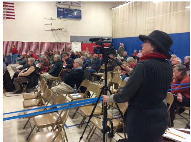
Debbie Lazar covers Town Meeting Day in Putney.